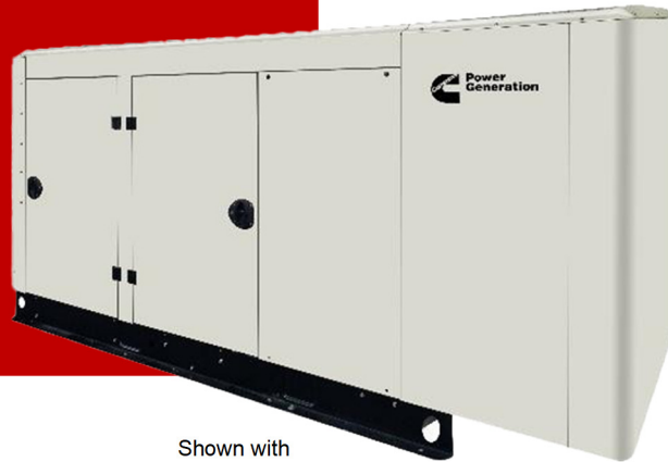
Shown with Sound Level 1 option